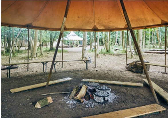
Central Yurt And Campfire