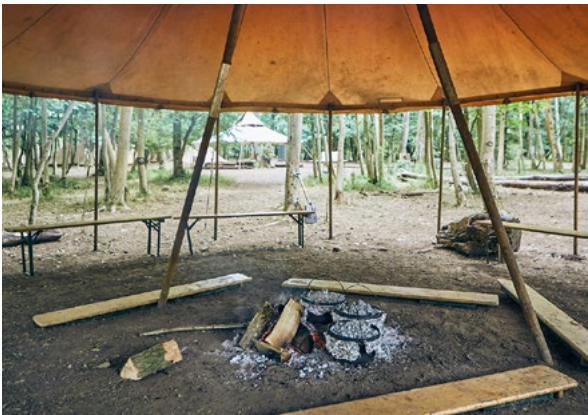
Central Yurt And Campfire