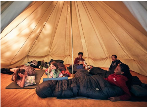
Inside Our Bell Tents