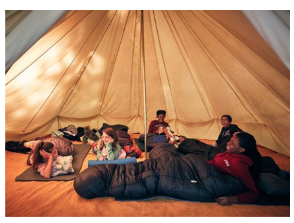
Inside Our Bell Tents