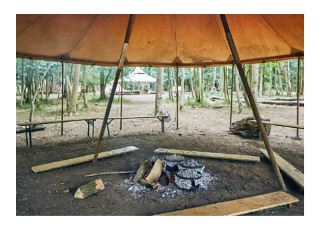
Central Yurt And Campfire