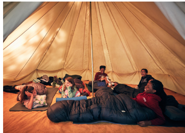
Inside our bell tents