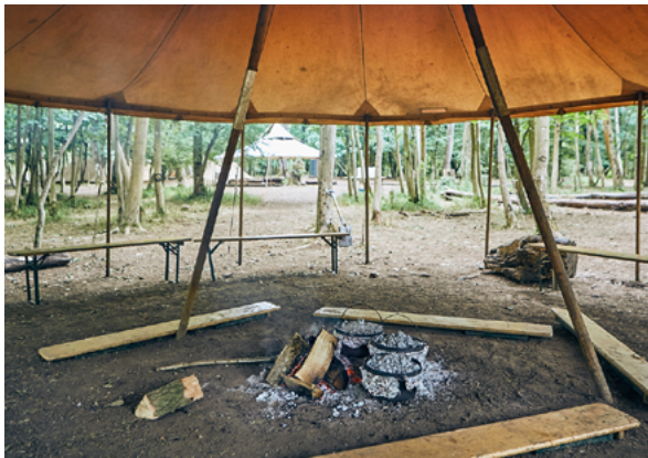
Central Yurt and campfire