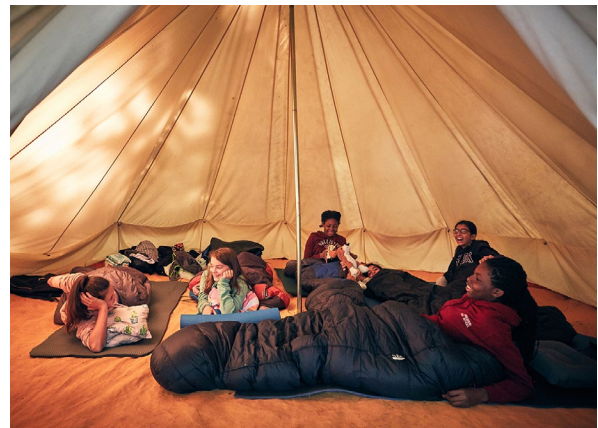
Inside Our Bell Tents