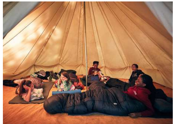
Inside our bell tents