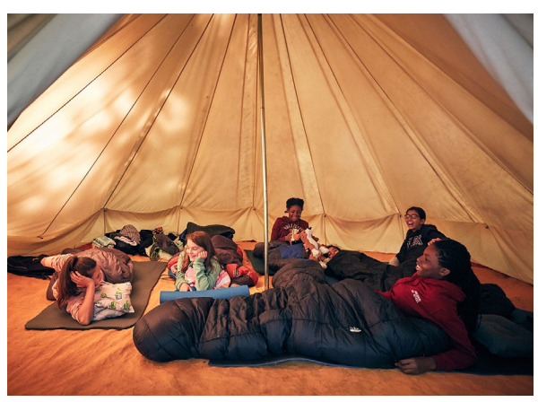
Inside Our Bell Tents